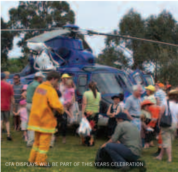
CFA DISPLAYS WILL BE PART OF THIS YEARS CELEBRATION

The Road Safety Expo and Cardinia Celebrates Children's Day have combined this year to provide children and their families with a fun filled, jam-packed free event to be held on Saturday 24 October 2009 at the Cardinia Cultural Centre within Lakeside from 10am to 2pm.